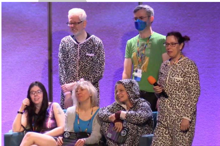
The Catastrophe team [– they were robbed. Ed].

Pick up questions from the ops hub. Hunt till the ops hub closes or runs out of eggs.