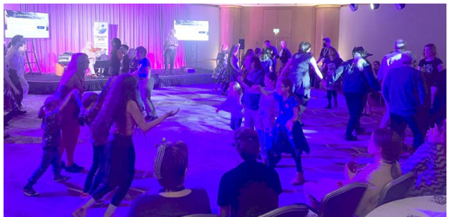
The Glasgow 2024 ceilidh

Do you still need a few more hours of volunteering to qualify for your reward t-shirt of tote bag? Head over to the ops hub to help out.